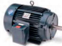
IEEE45 USCG Marine Duty