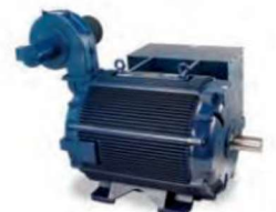
Dripproof Force Ventilated