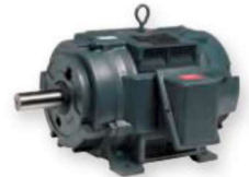
Oil Well Pumping